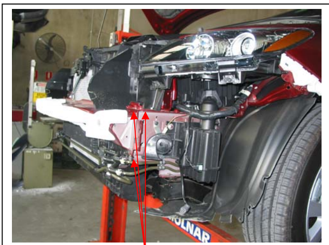
Figure 1: Bumper support panel bolts, three 14mm head bolts (per side)