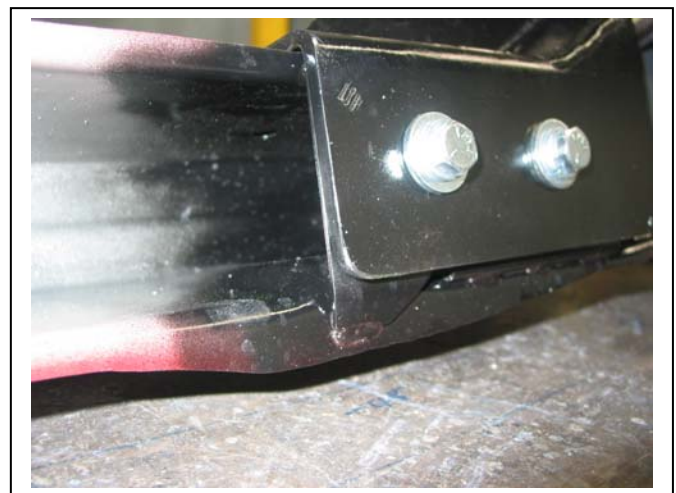
Figure 2: Steel mount bracket mounted to bumper support panel