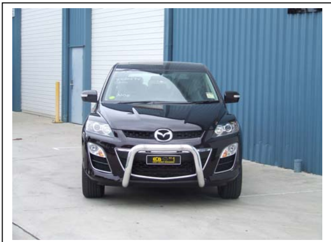
Figure 7: Front view 76mm Nudge Bar