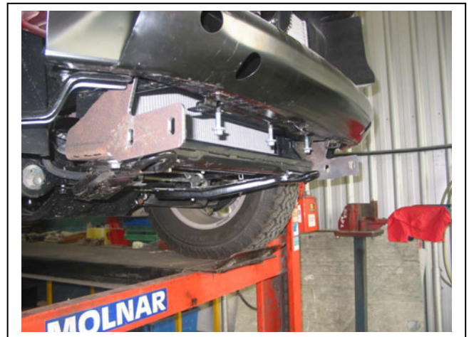
Figure 4: Steel mounts fitted to vehicle. Bumper removed for photo