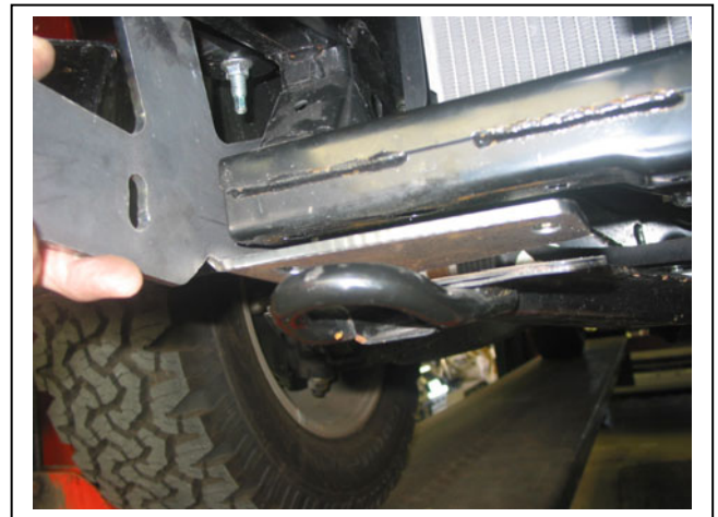
Figure 2: Fitting mount under stabilizer bar