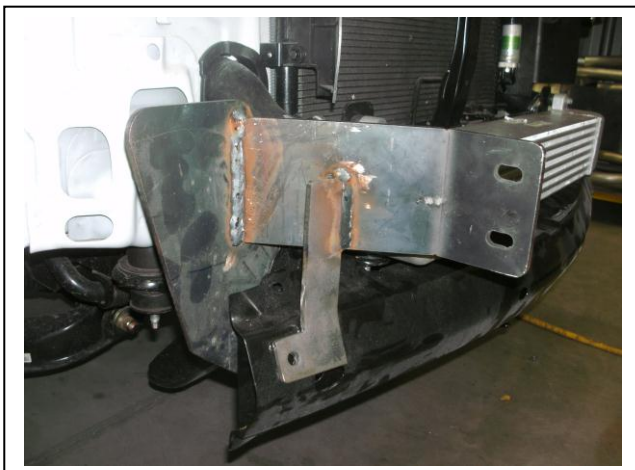
Figure 1: Mount between chassis and bumper support.