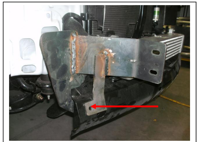
Figure 2: Drill top of bumper support to 10mm.