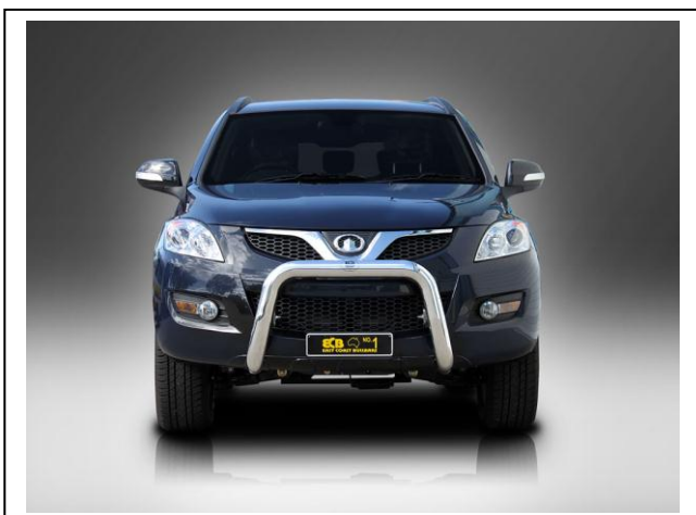
Figure 4: Front View