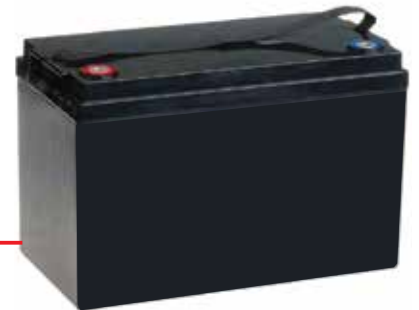
Vehicle Start Battery