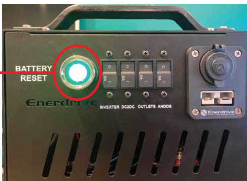
Battery Reset Button