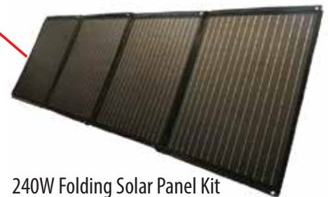
240W Folding Solar Panel Kit