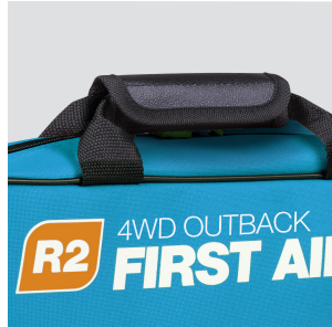
Portable grab and run soft pack case design with water resistant fabric backing