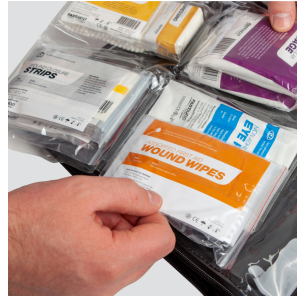
Colour coded contents to make locating the correct item fast and easy