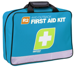
Portable grab and run soft pack case design with water resistant fabric backing